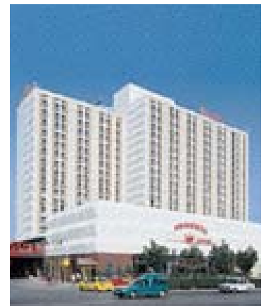
Hotel Princess - Sofia, Bulgaria Venue for IP-in-Action LIVE Eastern Europe